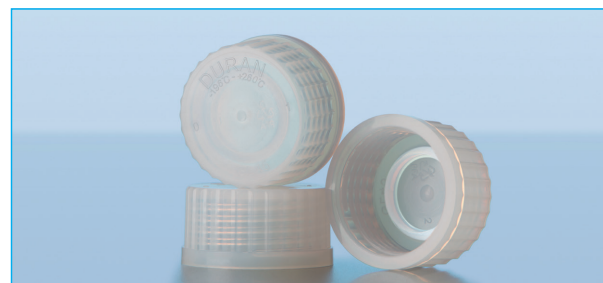
DURAN® PURE Premium Lip Seal Cap